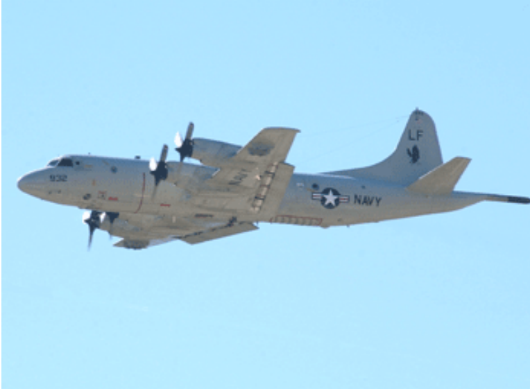
Figure 4: The P-3C Orion aircraft

In May 2004, the P-3C SSA organization achieved SW-CMM Maturity Level 4 as determined by a CMM-Based Assessment for Internal Process Improvement (CBA-IPI). They accomplished this feat in just 27 months. According to SEI data, an organization starting at Maturity Level 1 can take almost six years to reach Maturity Level 4 (as previously shown in Figure 1).