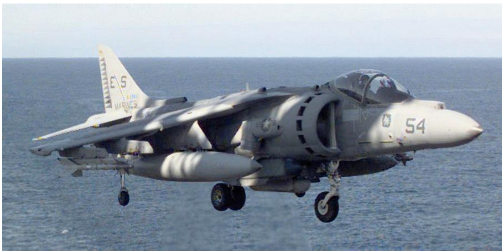
Figure 5: The AV-8B Harrier Aircraft

The organization described in this section is the AV-8B JSSA, located at China Lake, California. It provides software support for the AV-8B Harrier aircraft, shown in Figure 5, for the United States Marine Corps and its allies, Spain and Italy.